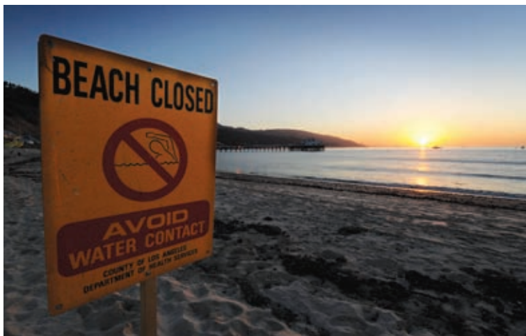
Pollution from urban runoff is a major cause of beach closures.