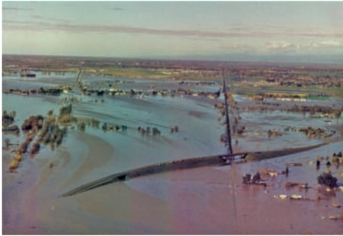
Urbanization on Central Valley floodplains increases risk to lives and property.

overall flood risk —or the economic consequences of flooding—by continuing to encourage population growth and economic activity behind levees.