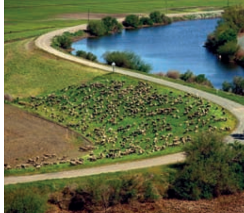
CALIFORNIA DEPARTMENT OF WATER RESOURCES

The need for change bulldozed a road down the center of my mind.