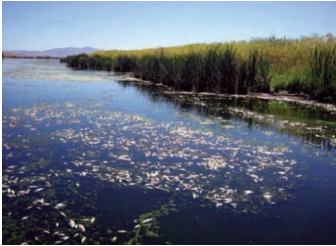
Fish kills are common in areas where pollution, dams, and algae create poor water quality, such as in the Klamath River.

common, because these releases can come at considerable cost to urban and agricultural water users.