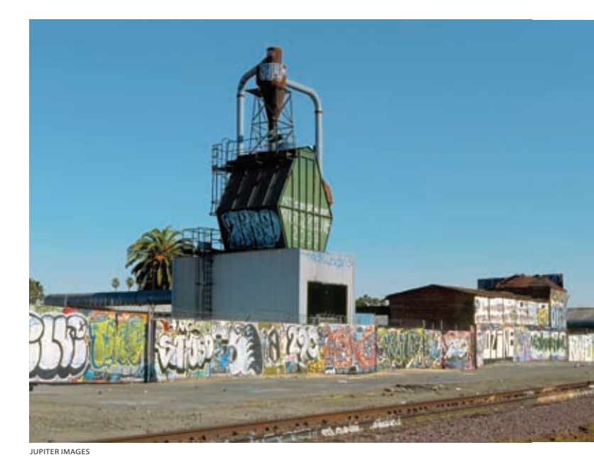
Zone eligibility criteria include measures of residential income, unemployment, and poverty.

A report sponsored by HCD (Nonprofit Management Solutions and Tax Technology Research, 2006) looked at a related concern: the effect of enterprise zones on neighborhood poverty, income, rents, and vacancy rates.<sup>24</sup> That study found that household economic and neighborhood housing indicators generally improve in enterprise zones relative to neighboring areas and the rest of the state. However, this study, like the CRB study, also used questionable control groups: It compared Census tracts in enterprise zones with adjacent tracts, although these were not necessarily similar in any other way to enterprise zones. It