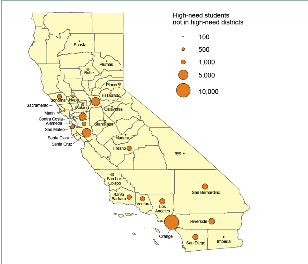
FIGURE 3. HIGH-NEED STUDENTS WHO DO NOT GENERATE CONCENTRATION FUNDING ARE CLUSTERED IN A FEW COUNTIES